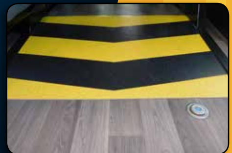
Altro safety floor insert*