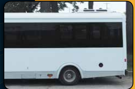
Upgraded bonded windows and stainless steel inserts*

Specifications subject to change without notice. GVWR = Gross Vehicle Weight Rating.