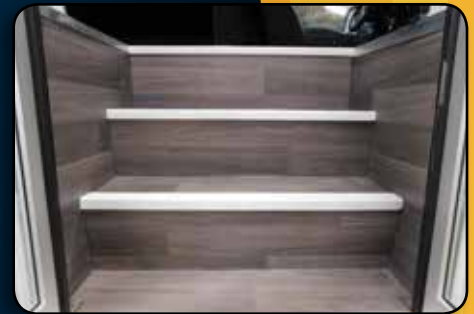
Premium wood-grain, transit approved flooring*