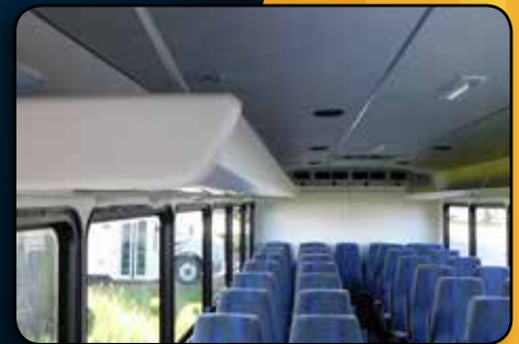
Overhead luggage upgrade; multiple configurations available*