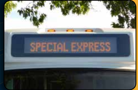
Front, side and rear destination signs available*

Specifications subject to change without notice; GVWR = Gross Vehicle Weight Rating.