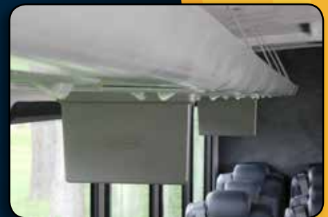
Multiple entertainment packages available