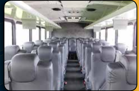
Optional overhead luggage bins, reading lights, Esquire Seating, and roof hatch

Specifications subject to change without notice; GVWR = Gross Vehicle Weight Rating.