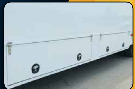
Available single and dual under floor storage