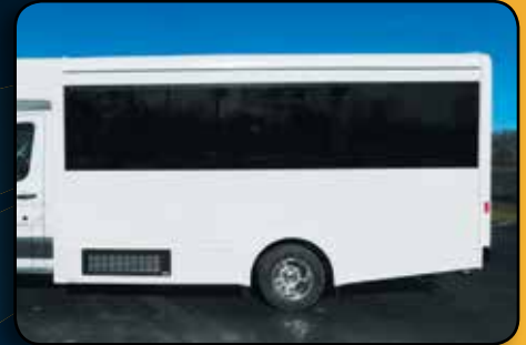
Upgraded bonded windows and stainless steel inserts*

Specifications subject to change without notice; GVWR = Gross Vehicle Weight Rating.