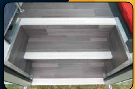
Premium wood-grain, transit approved flooring*

Take your virtual tour at www.glavalbus.com