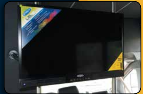
Available entertainment packages; 26" LCD shown*