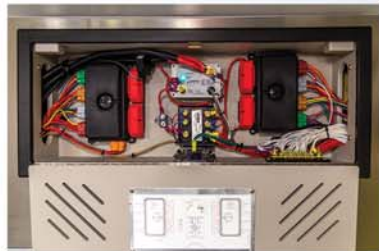
Bussman Vehicle Electrical Center