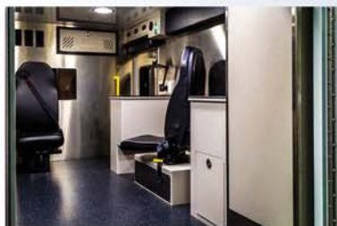
Curbside Swivel Tech Seating