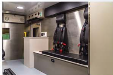
EVS V-4 or 6Pt Seat Belt System