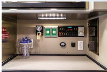
HDPE A/A Control Panel